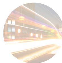
Finance and Business