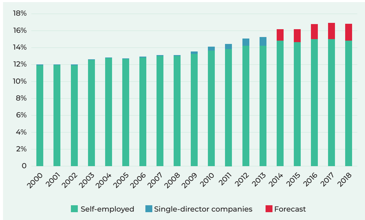
FIGURE 1: GROWTH OF SELF-EMPLOYED WORKFORCE AND SINGLE-DIRECTOR COMPANIES. AS A PROPORTION OF TOTAL EMPLOYMENT, FORMS OF SELF-EMPLOYMENT REMAINED STABLE UNTIL AROUND 2008 AND HAVE SUBSEQUENTLY EXPERIENCED STEADY GROWTH.

Source: NEF calculations based on ONS (2019) 17