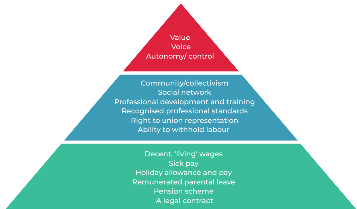
FIGURE 3: A FRAMEWORK FOR PRINCIPLES OF WORK

These principles are all important, but we recognise that without the presence of the most basic minimum requirements for a decent standard of living (material rights) it is difficult, if not impossible, to achieve progression and social networks, let alone the autonomy, value, and voice which characterise the best version of working life. The following framework is helpful to visualise how these dimensions relate to each other.