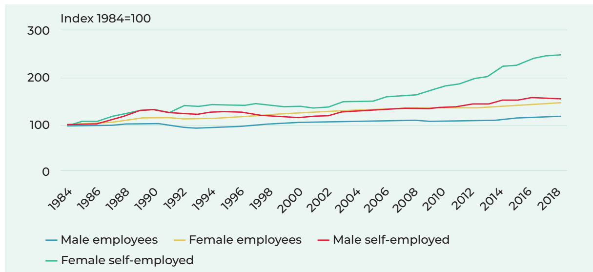
FIGURE 2: FEMALE SELF-EMPLOYMENT HAS GROWN MORE STEEPLY SINCE THE 2008 ECONOMIC DOWNTURN